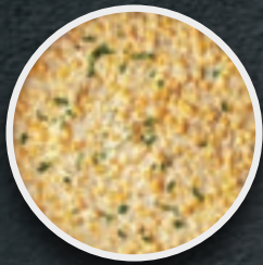
BIG MOMMA'S CREAMED CORN