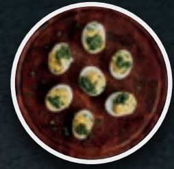
SARAH'S DEVILED EGGS