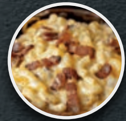
CHESSY BACON MAC N CHEESE