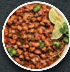
COWBOY PINTO BEANS