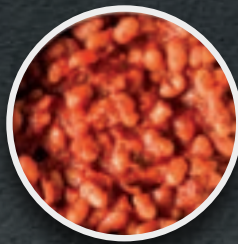
BUCK'S BBQ BEANS