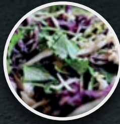
KICKIN COLD SLAW