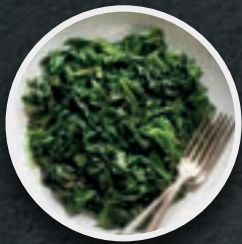
MOMMA'S COLLARD GREENS