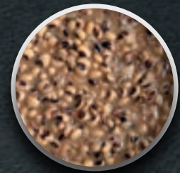
GRAND DADDY'S BLACK EYE PEAS